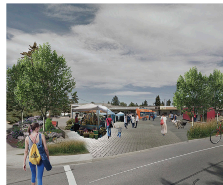
Acadia Pop-Up Plaza A neighbourhood gathering space is also a traffic calming strategy. A prototype of the Pop-Up Plaza turns unused parking stalls into an “outdoor living room”, with outdoor furniture, espresso, pop-up bookstore, bocce ball, ping pong, board games, arts & crafts, snacks, and simple traffic calming.

Sustainable Calgary’s Active Neighbourhoods Canada program has been developing design schemes based on community feedback for the past six years. These aim to promote more liveable, walkable and vibrant communities. What do healthy places look like? Here are some of our ideas!