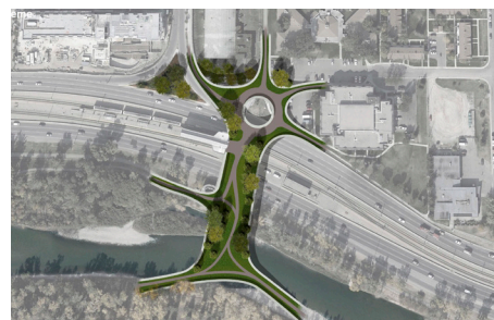
Landscape LRT Bridge, Bridgeland-Riverside The green bridge creates an oasis above city traffic and helps connect three popular communities that each have missing amenities.