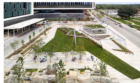
Healthy Places: Focus on health care facilities Health facilities are meant to improve health, but how can they do so beyond the walls, in the neighbourhoods of which they are a part?

“Generally, areas with higher population density, a mix of residential, commercial, educational and employment areas, connected streets, good access to destinations, bike paths, good sidewalks, good public transit, green spaces and attractiveness have been linked to more active transportation or reduced driving” — Dr. Theresa Tam, Chief Public Officer of Health