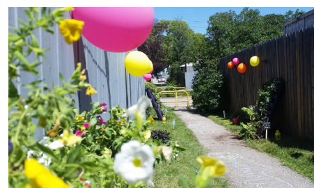
Reimagine Catwalks Project How can we take advantage of great existing infrastructure? Catwalks are pedestrian pathways that provide shortcuts to schools, parks, stores and bus stops.

Green walking networks, parkside living and gentle density make walking/cycling safe and attractive, and increase use of local parks.