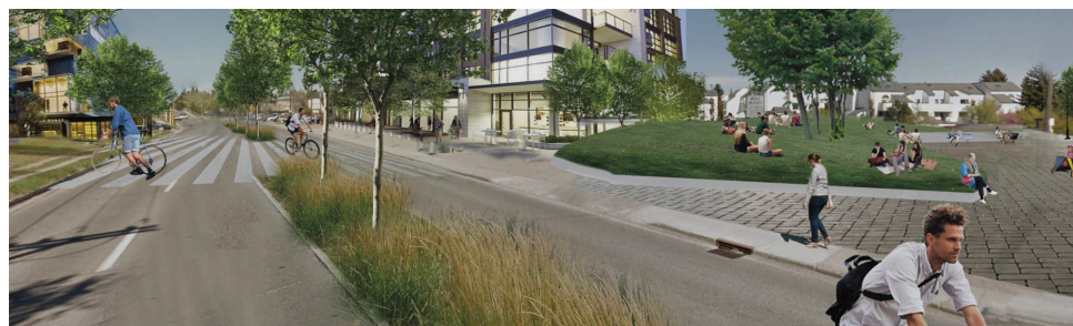
Re-imagining Bonaventure Drive, Acadia

Behind almost every commercial street in Calgary sits another street that does the ‘dirty work’: loading, shipping, and dividing commercial from residential. What if it became a walkable main street?