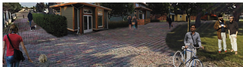
Laneway + Parkway, Marlborough, Calgary

Green walking networks, parkside living and gentle density make walking/cycling safe and attractive, and increase use of local parks.